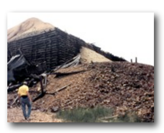
Exploring mine tailings