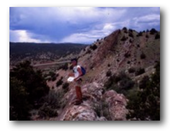
Mapping Nasty Knob on Twin Mountain