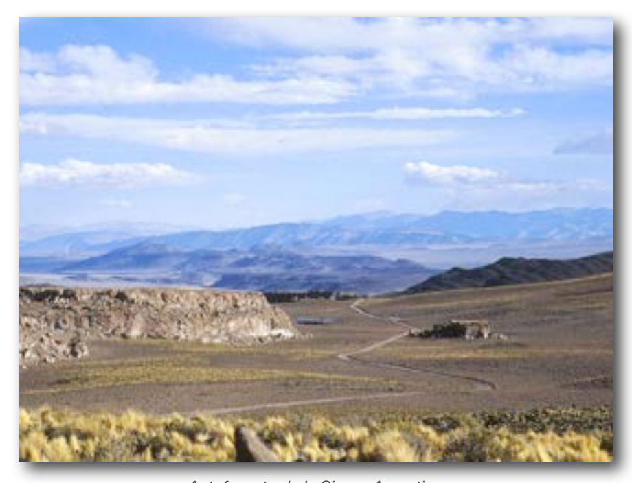
Antofagasta de la Sierra, Argentina