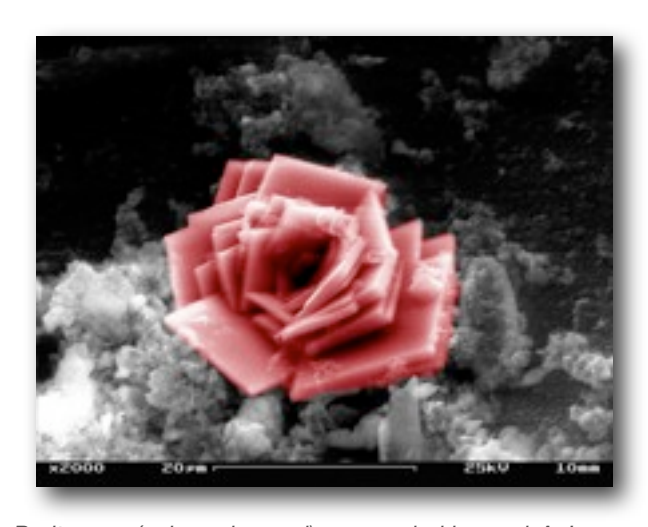
Barite rose (color-enhanced) surrounded by opal-A.