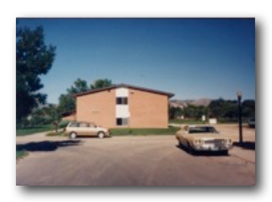
Staying at the Abbey