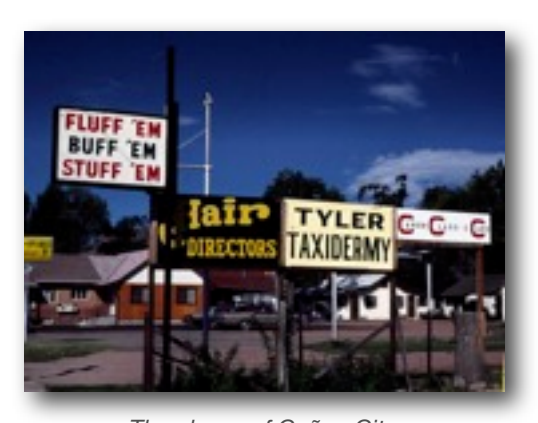
The charm of Cañon City